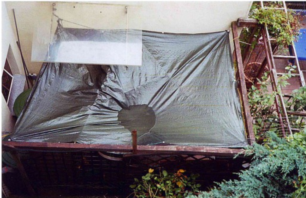
Fig. 2: Recent model for getting raining water in the city of Bremen with a plastic cistern. (Foto: Prof. Dr. D. ORLAM, Bremen).